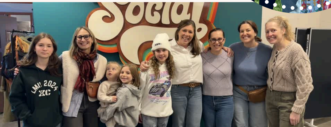
Kamaji Campers Past, Present and Future in Brooklyn, NYC!