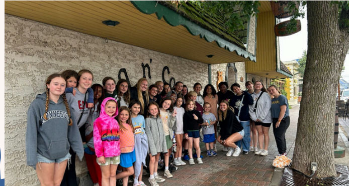
2025 8 WEEKERS OUT FOR A SPECIAL DINNER AFTER A DAY OF BUMPER CARS AND MINI GOLF!

MONDAY, JULY 13TH — SATURDAY, AUGUST 8TH